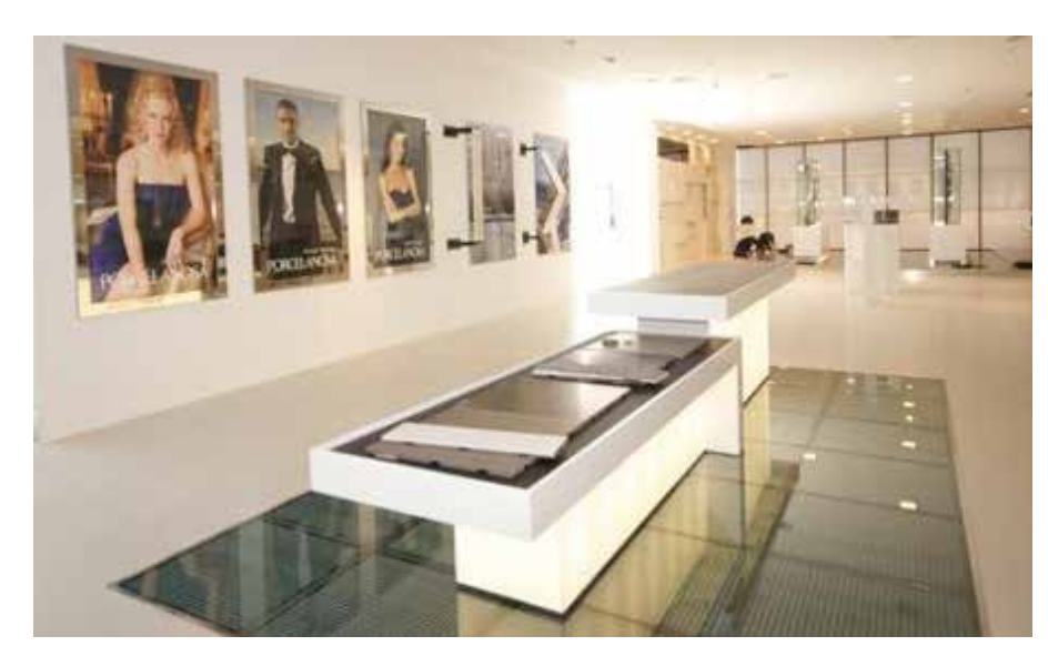
Ceramic tile-laying products show room

in a master/slave mode. Applied solution: