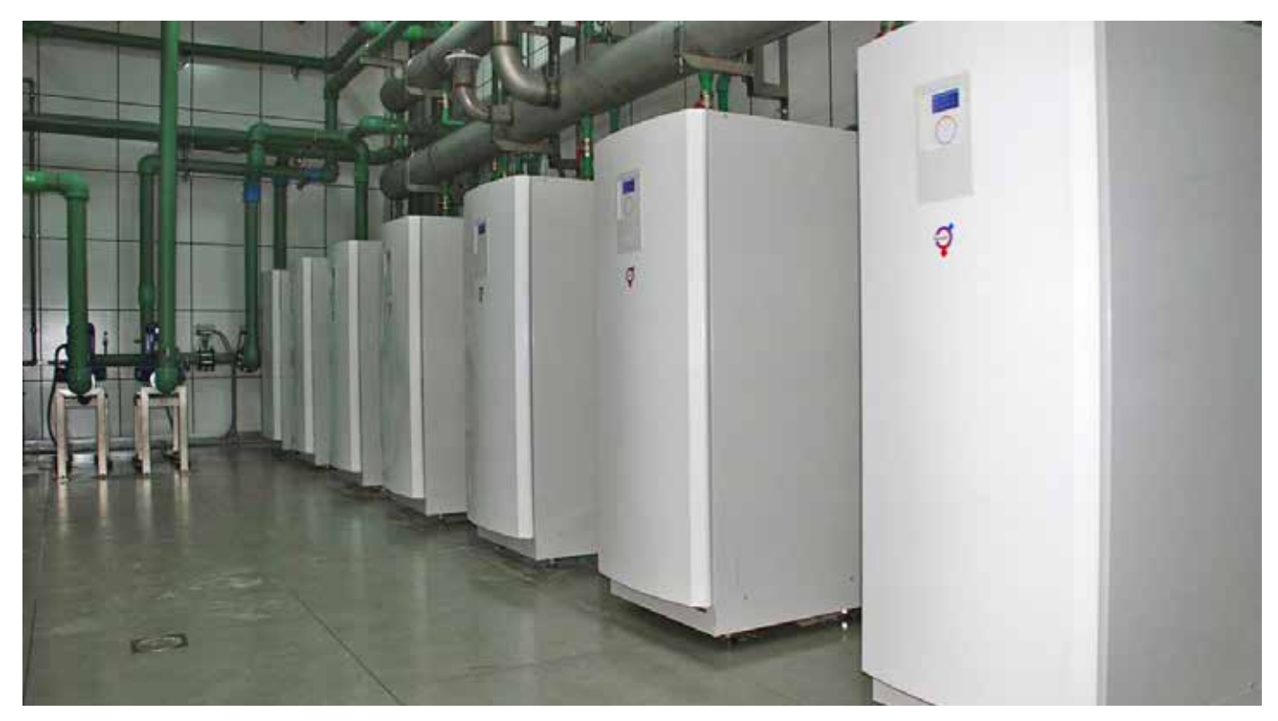
The heating room with Thermia Robust ground source heat pumps